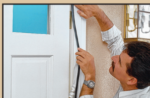
See story on Page 13

Don't throw it out — use it in the garden!