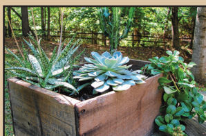
See story on Page 24

Going Green is published quarterly by The Recorder, of Greenfield, Mass., to help readers in the Pioneer Valley of Western Massachusetts and southern Vermont sustain and protect our natural resources for future generations.