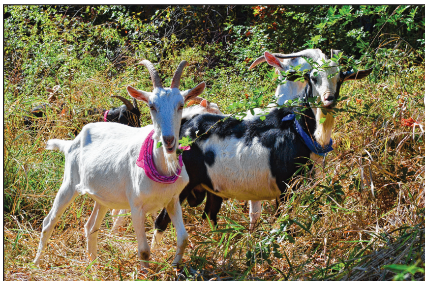
Two goats from the Goat Girls flock clear poison ivy from the grounds at Amherst's Hitchcock Center for the Environment.