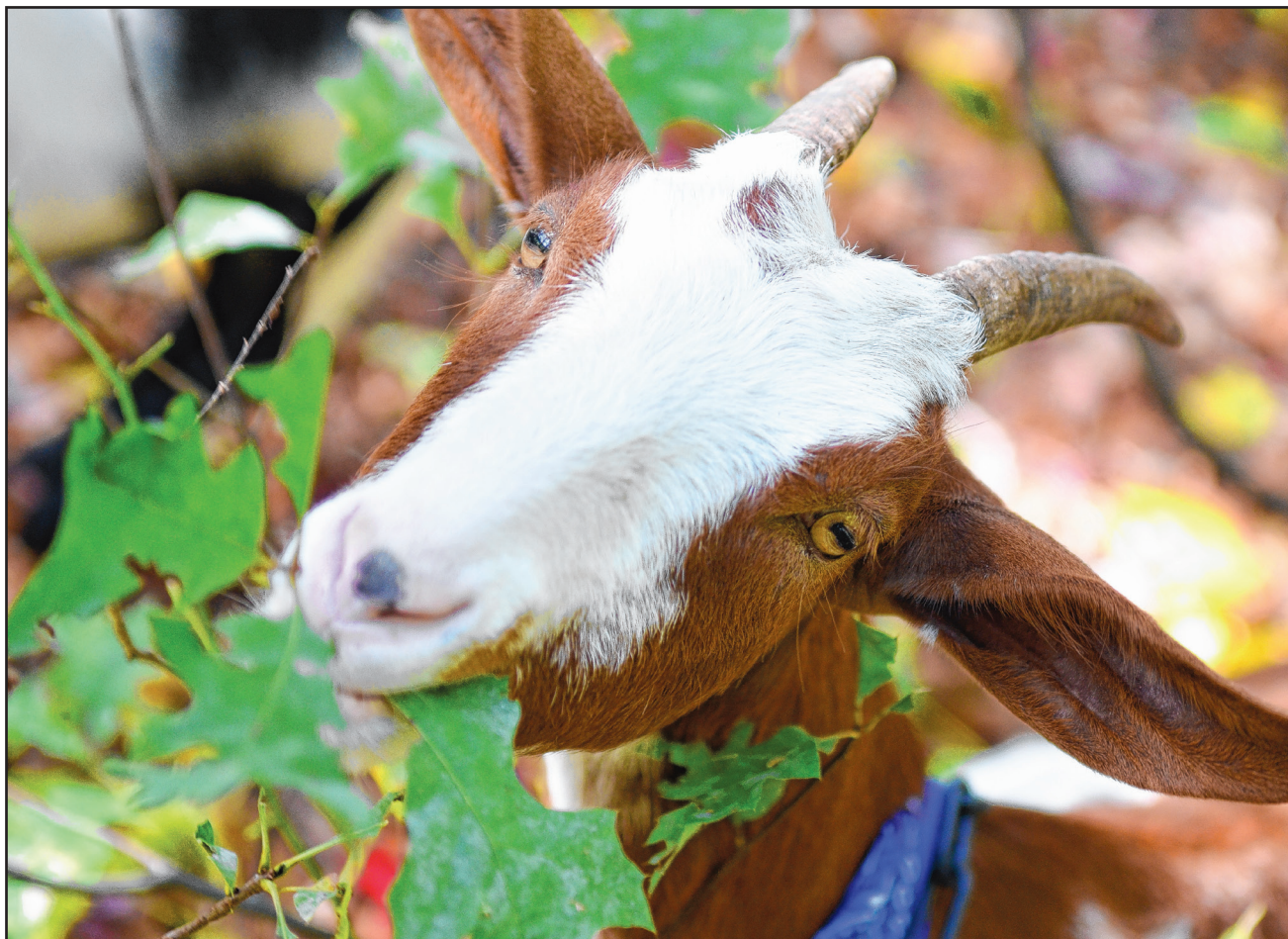
While sheep graze low to the ground, goats are drawn to plants that are higher off the ground, making them ideal for brush-clearing duties.