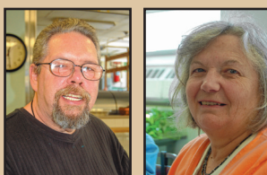
See story on Page 16