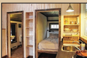
See story on Page 18