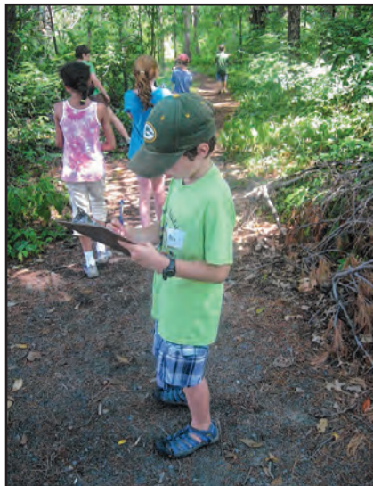
A young team member keeps track of species seen on a recent Hitchcock Biothon.